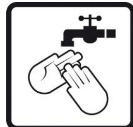
Rinse in cold water before washing