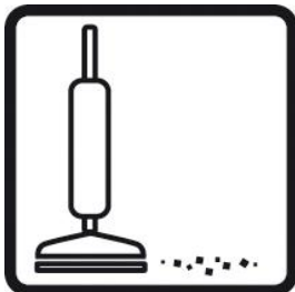
Clean area using vacuum equipment