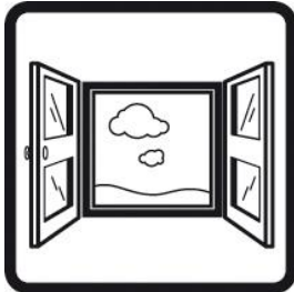
Ventilate working area if possible

“The mechanical effect of fibres in contact with skin may cause temporary itching”