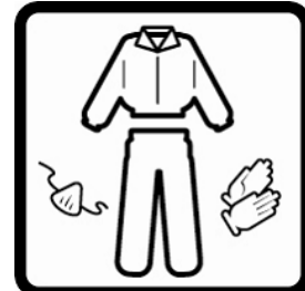
Cover exposed skin. When working in unventilated area wear disposable face mask